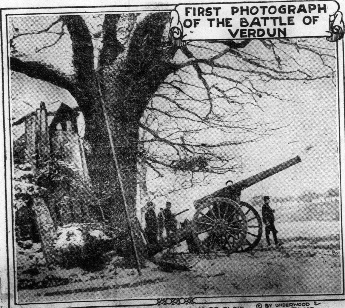
IN THE BATTLE THAT HAS BEEN RAGING AROUND VERDUN THE FRENCH ARTILLERY HAS PLAYED A PROMINENT PART IN STOPPING THE GERMAN ADVANCE. ONE OF THE GUNS THAT FIGURED IS SHOWN IN THE ABOVE PICTURE.

the ship. At the same time the Austrians looted whatever they could in the time given. They lowered one of the small boats to take them and their loot back to the submarine.