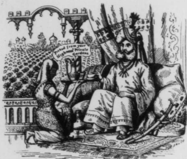
FACSIMILE OF CUT ON EACH PACKAGE.