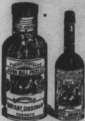
This is a facsimile of our bottles.

BRYANT, GIBSON & Co., TORONTO, Manufacturers of