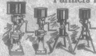
FOUR MODELS—16 SIZES

There is only one "Melotte"—The "Melotte" that we have been selling to Canadian Farmers for 25 years.