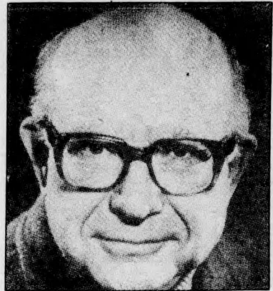
One-time Prof Mavor Moore visited York last week to criticize critics

Moore pointed to a long list of contradictions in the history of art theory in leading up to the over-intellectualization of academic critics today. His long list of examples included "Art must imitate nature," "Art must improve nature" and "Beauty is in the eye of the