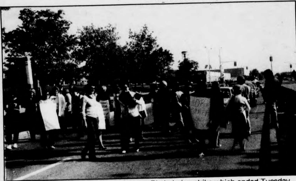
YUSA picketers marching on St. Lawrence Blvd. during strike which ended Tuesday.