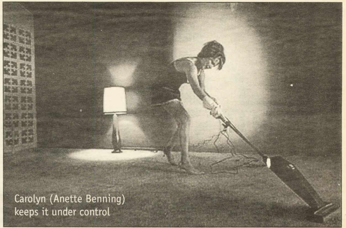
Carolyn (Anette Bening) keeps it under control

American Beauty is a film that depends on its cast and script, and both are flawless. Notably