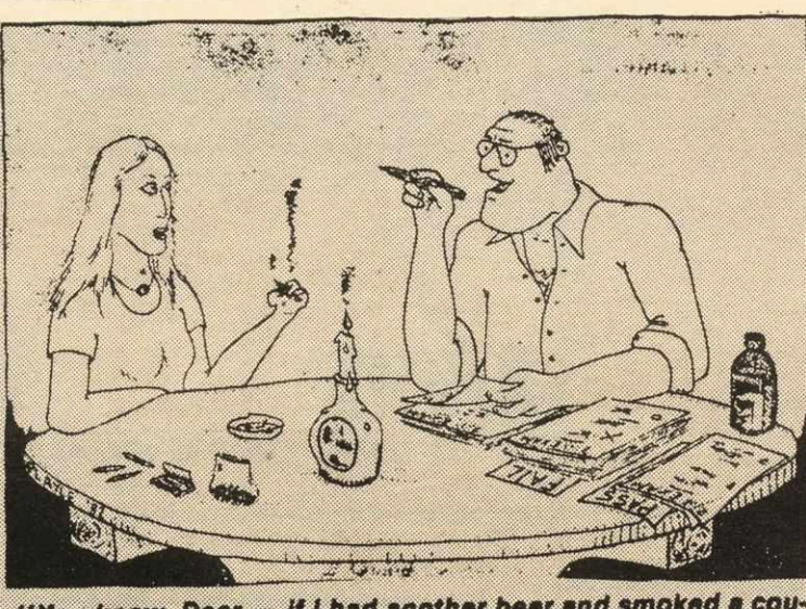
"You know, Dear - if I had another beer and smoked a couple of joints, maybe half of these kids would pass."

Lecture: Unemployment, inflation and the world economy will be some of the topics discussed at Dal's lecture series, The Market Economies: Prospects for the 1990s, to take place on consecutive Thursday evenings (5, 12, 19). Info at 424-2517