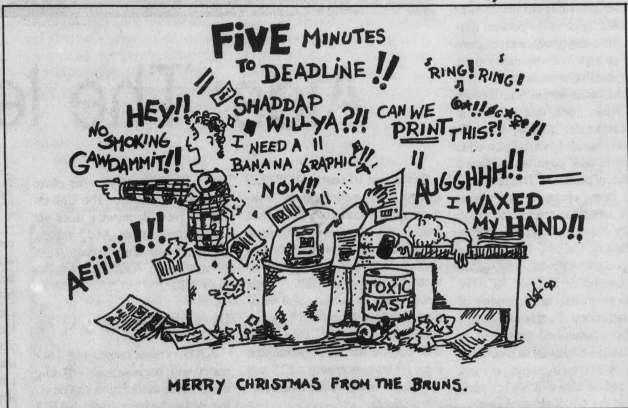
MERRY CHRISTMAS FROM THE BRUNS.