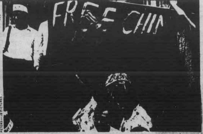
NEW YORK: demonstrators gather outside the United Nations