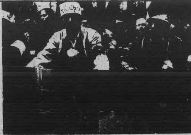
STUTTGART: students hold a sign saying CHINA BLEEDS