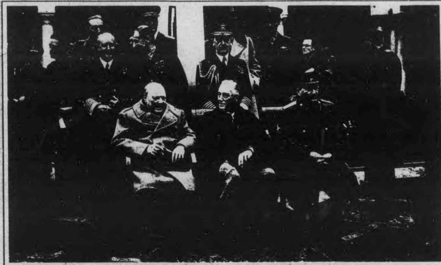
The Big Three at Yalta: in effect, if not by intent, a sanction for Soviet dominance