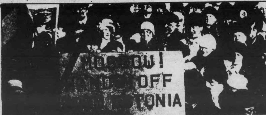
Estonians protest in Russia. They reflect the new reform movement in Eastern Europe.