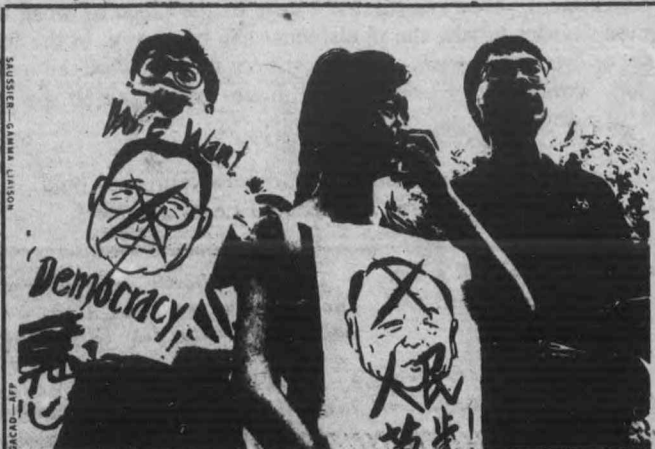
MANILA: a protester weeps at a rally outside the Chinese consulate