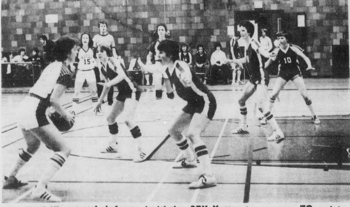
The Ked Bloomers' defence held the SFX Xettes to a mere 79 points over the weekend as UNB downed them 54-30 and 67-49.

9) Which was the first U.S.A. team to enter the NHL? When? 10) What is the NHL record for the fastest three goals by two teams in one period?