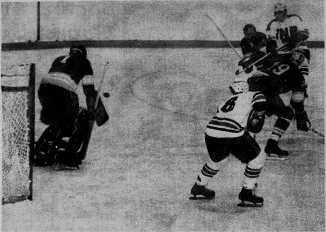
The Red Devils exerting pressure on the STU defence. In a hard fought and exciting game, the two teams played to a 4-4 draw after one overtime period.

This column was on Biafra, but that's not so unrelated to the European auto-fuel industries.