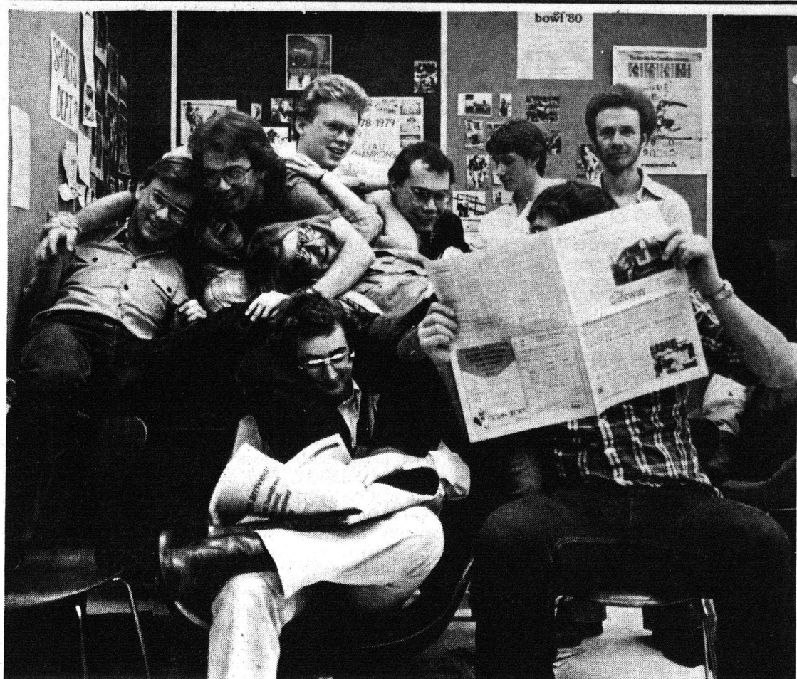
Sweet and innocent clean-cut young Getaway staffers - and if you don't think that's funny maybe you should take a closer look at this issue!