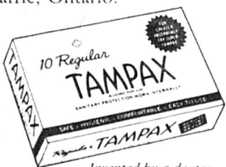
Invented by a doctor . . . now used by millions of women

Try Tampax . . . this winter. Enjoy most of its advantages right now. You'll get the final advantage next summer, when you'll be able to swim any time of the month. Canadian Tampax Corporation Limited, Barrie, Ontario.