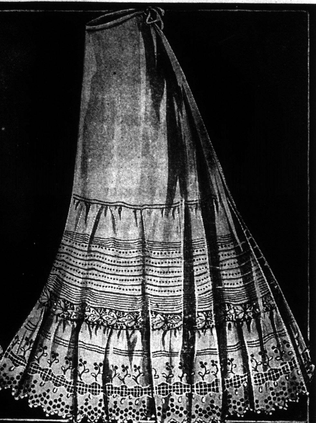
19-2807. Women's Skirt , made of soft finished cotton, French band, 10 1/4 inch flounce of fine lawn trimmed with two clusters of hair tucks, one cluster of hem-stitched tucks, finished below with one row wide Swiss embroidery insertion and nine inch flounce of extra handsome embroidery trimmed with three narrow tucks, under dust ruffle, generous width, lengths 38, 40 and 42 inches. Sale Price ..... 1.63