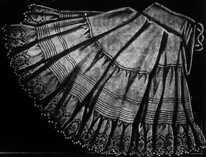
19-2802. Women's Skirt , made of fine soft finished cotton French band, deep umbrella flounce of fine lawn, trimmed with one cluster of three narrow tucks, one cluster of five narrow tucks, finished below with deep ruffle of good strong serviceable embroidery, well made and finished in every way, lengths 38, 40 and 42 inches. Sale Price ..... .73