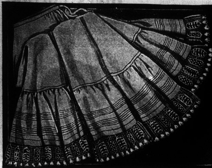
19-2801. Women's Skirt , made of fine soft finished cotton French band, deep flounce of lawn trimmed with two clusters of five narrow tucks, finished below with three inch ruffle of good strong lace, well made in every way, generous width, lengths 38, 40 and 42 inches. Sale Price ..... .55