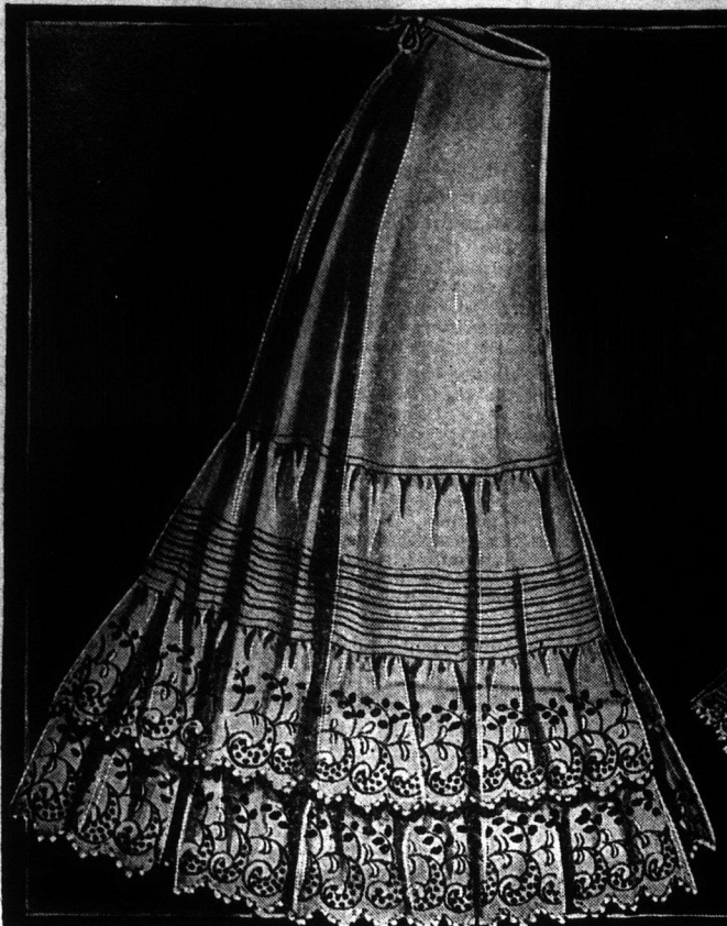
19-2806. Our Famous Double Flounce Skirt , made of soft finished cotton, French band, has eight inch flounce of fine lawn trimmed with five 1/4 inch tucks and double seven inch flounce of handsome embroidery, extra fine, lengths 38, 40 and 42 inches, under dust ruffle. Sale Price ..... 1.55