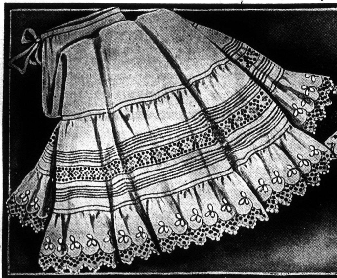
19-2803. Women's Skirt , made of soft finished cotton, French band, deep umbrella flounce of fine lawn, trimmed with two clusters of five narrow tucks, one row fine embroidery insertion between, finished below with deep ruffle of good strong embroidery, neat patterns, lengths 38, 40 and 42 inches. Sale Price ..... .85