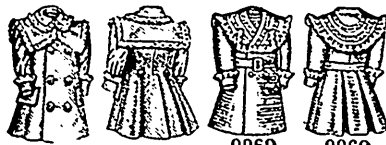
2011 Little Boys' Long Coat or Overcoat. Ages, 2 to 5 years, 4 sizes. Price, 7d. or 15 cents. 2011 Little Boys' Long Coat or Overcoat. Ages, 2 to 5 years, 4 sizes. Price, 7d. or 15 cents. 9960 Little Boys' Long Coat. Ages, 2 to 5 years, 4 sizes. Price, 10d. or 20 cents. 9960 Little Boys' Long Coat. Ages, 2 to 5 years, 4 sizes. Price, 10d. or 20 cents.