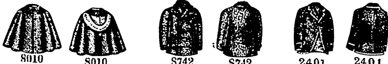
8010 Boys' Military Cape, with Removable Hood. Ages, 2 to 12 years, 11 sizes. Price, 10d. or 20 cents. 8010 Boys' Military Cape, with Removable Hood. Ages, 2 to 12 years, 11 sizes. Price, 10d. or 20 cents. 8742 Little Boys' Pea-Jacket. Ages, 2 to 8 years, 7 sizes. Price, 10d. or 20 cents. 8742 Little Boys' Pea-Jacket. Ages, 2 to 8 years, 7 sizes. Price, 10d. or 20 cents. 2401 Boys' Jacket. Ages, 3 to 12 years, 10 sizes. Price, 7d. or 15 cents. 2401 Boys' Jacket. Ages, 3 to 12 years, 10 sizes. Price, 7d. or 15 cents.