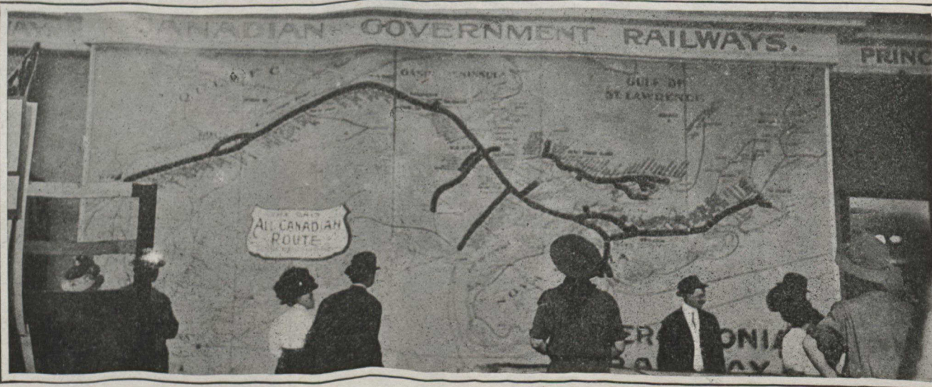
The Intercolonial Railway was well advertised at the Canadian National Exhibition, Toronto, by a system of Electric Lights, which gave the effect of rapidly-moving trains.