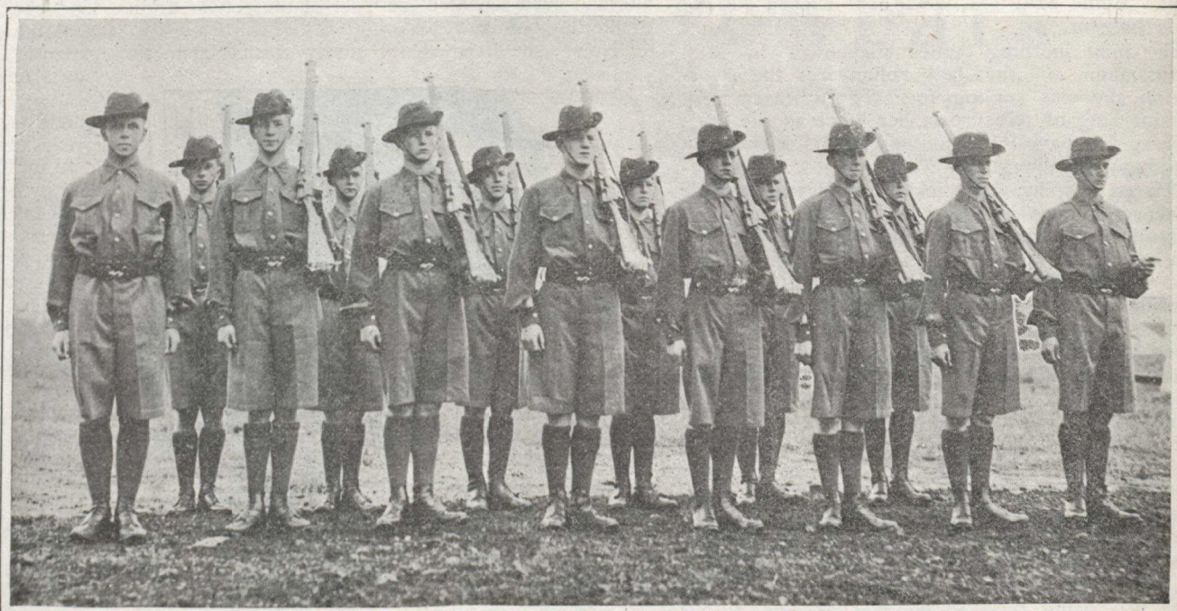
New Zealand's Well-set-up, Well Drilled, Cadets, who Won the Honours at the Canadian National Exhibition, Toronto.