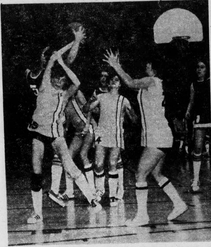
Red Bloomer action during a jump in mid-court in last week's tangle with the Dalhousie Tigerettes.

Writer's note: I would like to congratulate everyone who was graded to higher belts over the past couple of weeks. Keep up the good work!