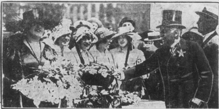
The picture shows Lord Charles Beresford, who opened a floral fair in London for charity purposes as he was handing a basket of flowers to a group of French actresses who were to sell the flowers in hotels and on the streets.