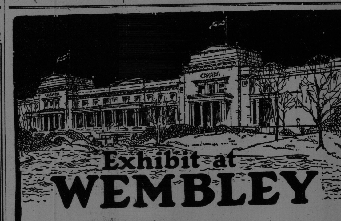
Exhibit at WEMBLEY

Without obligation kindly forward me your booklet "Some Day You May be Old." I am _____ years of age, and would like to accumulate $ _____ towards independence. Name _____ Address _____