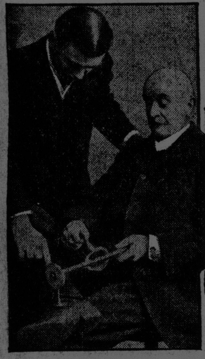
Showing a Rheumatic Sufferer How to Use the Veedee

Sciatica Neuritis Neurasthenia Stammering Debility Kidney Com- plaints Asthma Weak Eyes Catarrh Rheumatism Paralysis Neuralgia Lumbago Indigestion Bronchitis Liver Troubles Deafness