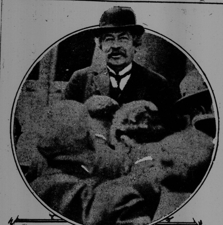
France for the tenth time, shows him answering questions of reporters