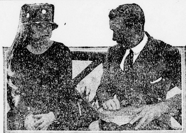
"Haven't you met me before, somewhere?" DOUGLAS FAIRBANKS in "He Comes Up Smiling" A Paramount Picture AT THE MAJESTIC MONDAY, TUESDAY AND WEDNESDAY.

into Paramount pictures with "The Flame of the Yukon." But since then she has advanced steadily with such splendid pictures as "The Making of a Hero," "The Kaiser's Shadow," "Love Me," "Tyrant Fear," etc.