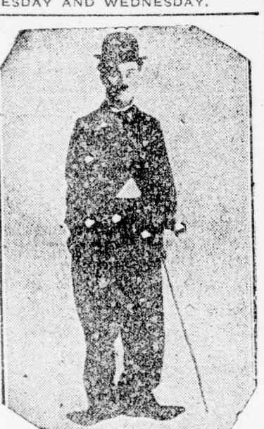
CHARLIE CHAPLIN in his greatest comedy, "The Musical Tramp," showing at the Majestic Theatre next Friday and Saturday.

the new salary would be one million and a half dollars ($1,500,000) a year, about twenty times the amount of President Wilson's salary. Never before in the history of moving pictures or of the stage has any one star been offered such a sum for her talent. A few years at an income of a million and a half will place Miss Pickford amongst the