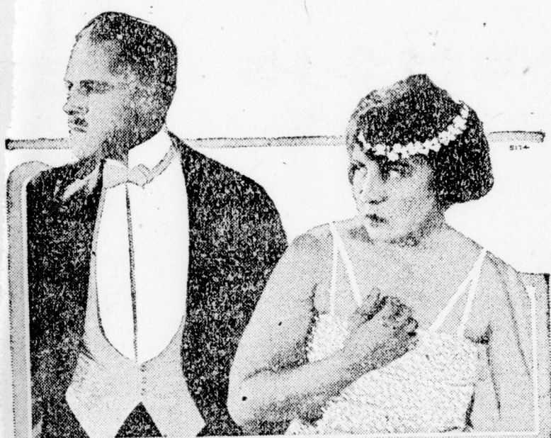
Thomas H. Ince presents DOROTHY DALTON in "Green Eyes" A Paramount Picture AT THE MAJESTIC THURSDAY AND FRIDAY NEXT.