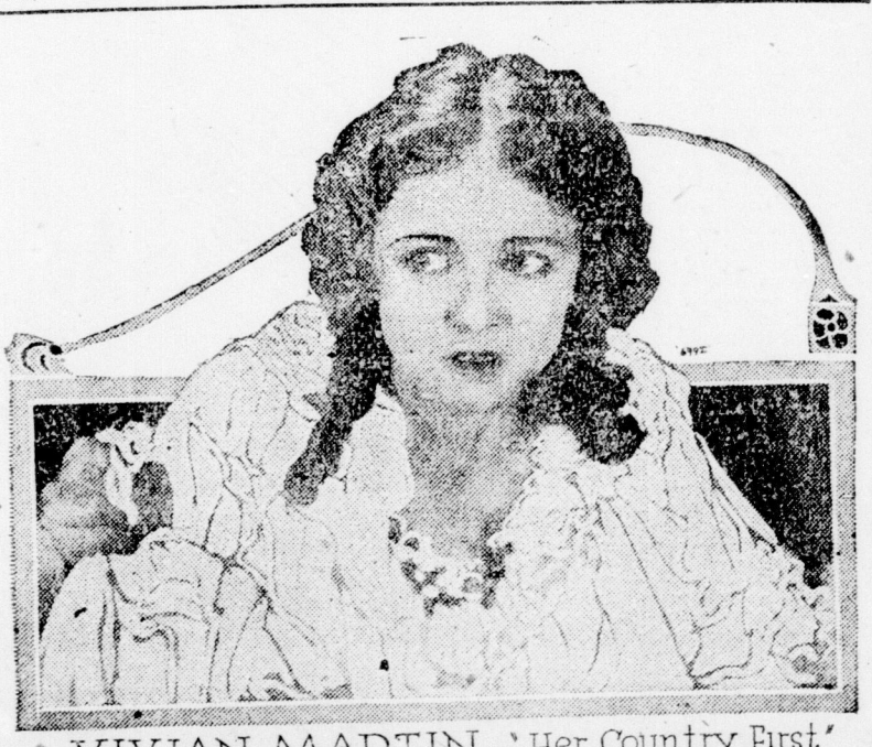
VIVIAN MARTIN in "Her Country First" A Paramount Picture AT THE MAJESTIC NEXT SATURDAY ONLY.

great millionaires of the world. Miss Pickford's success is as wonderful as the new salary offered her. From acting in small stock companies in and around Toronto, she has become known and loved in the north, south, east and west, and it is safe to say that there