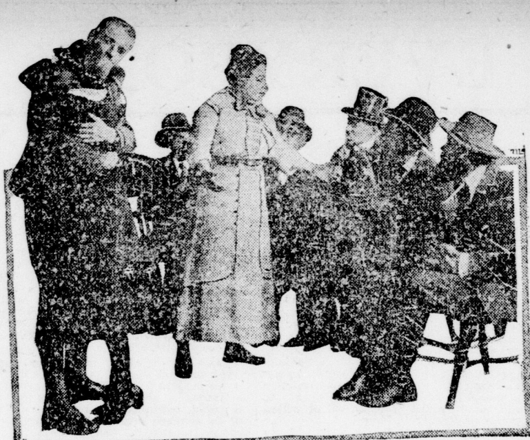
Scene From "Come On In" Starring SHIRLEY MASON and ERNEST TRUEX A Paramount Picture AT THE MAJESTIC TODAY ONLY.

Dorothy Dalton made her biggest hit, perhaps, up to the time of her entrance