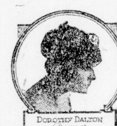
DOROTHY DALTON A Paramount Picture

Girls, you should see Dorothy's New Gowns.