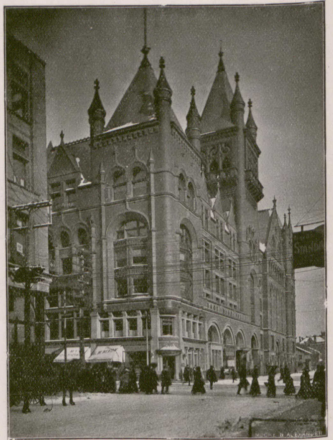
PERSPECTIVE VIEW AFTER ALTERATION.