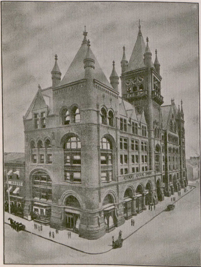
PERSPECTIVE VIEW BEFORE ALTERATION.