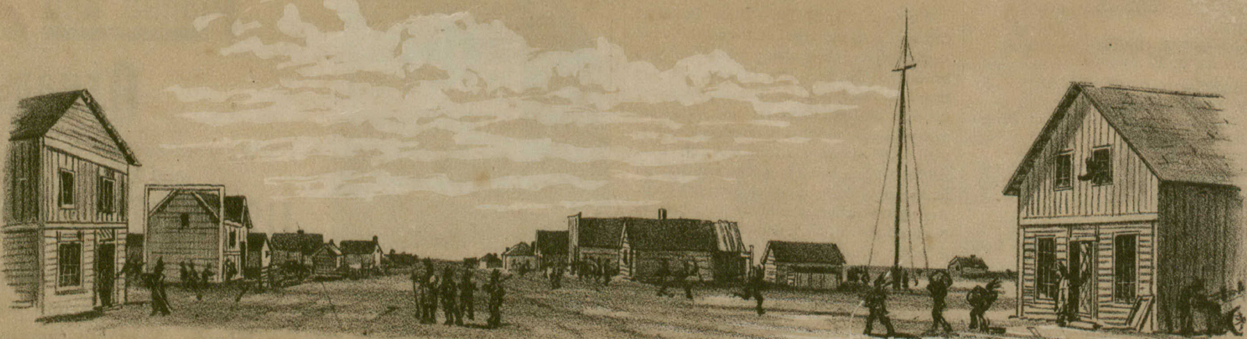
THE TOWN OF BATTLEFORD, OCCUPIED BY THE REBELS AND INDIANS MARCH 30TH.