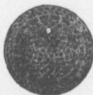
Locked Coil Winding Cable.

Mines, Tramways, Aerial Ropeways, Suspension Bridges, Cranes, Elevators, Transmission of Power, Steam Ploughing and General Engineering Purposes.