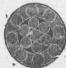
Locked Coil Aerial Cable or Colliery Guide.