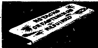
MEALEY STAIR PAD

Manufacturers of Wadded Carpet Lining and STAIR PADS Hamilton, Ont.