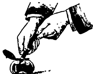
The "Post" Way.