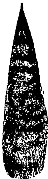
Natural Wavy. 16 inch. $1.00 to $2.50.