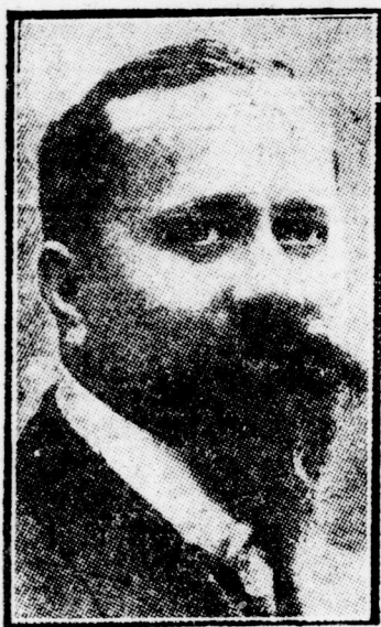
PROF. ALBERT CALMETTE, assistant director of the Pasteur Institute, Paris, who, after experimenting extending over thirty years, announces his new vaccine, "BGG," which has been successfully used to inoculate young animals and even babies against tuberculosis.

descent for Moses from a palace to the wilderness, but God seldom takes a great man out of a rich man's palace. Israel needed a leader and as God called Lincoln from a log cabin, He called Moses from a shepherd's crook. Moses worked with the Israelites and made a splendid nation of a great mob.