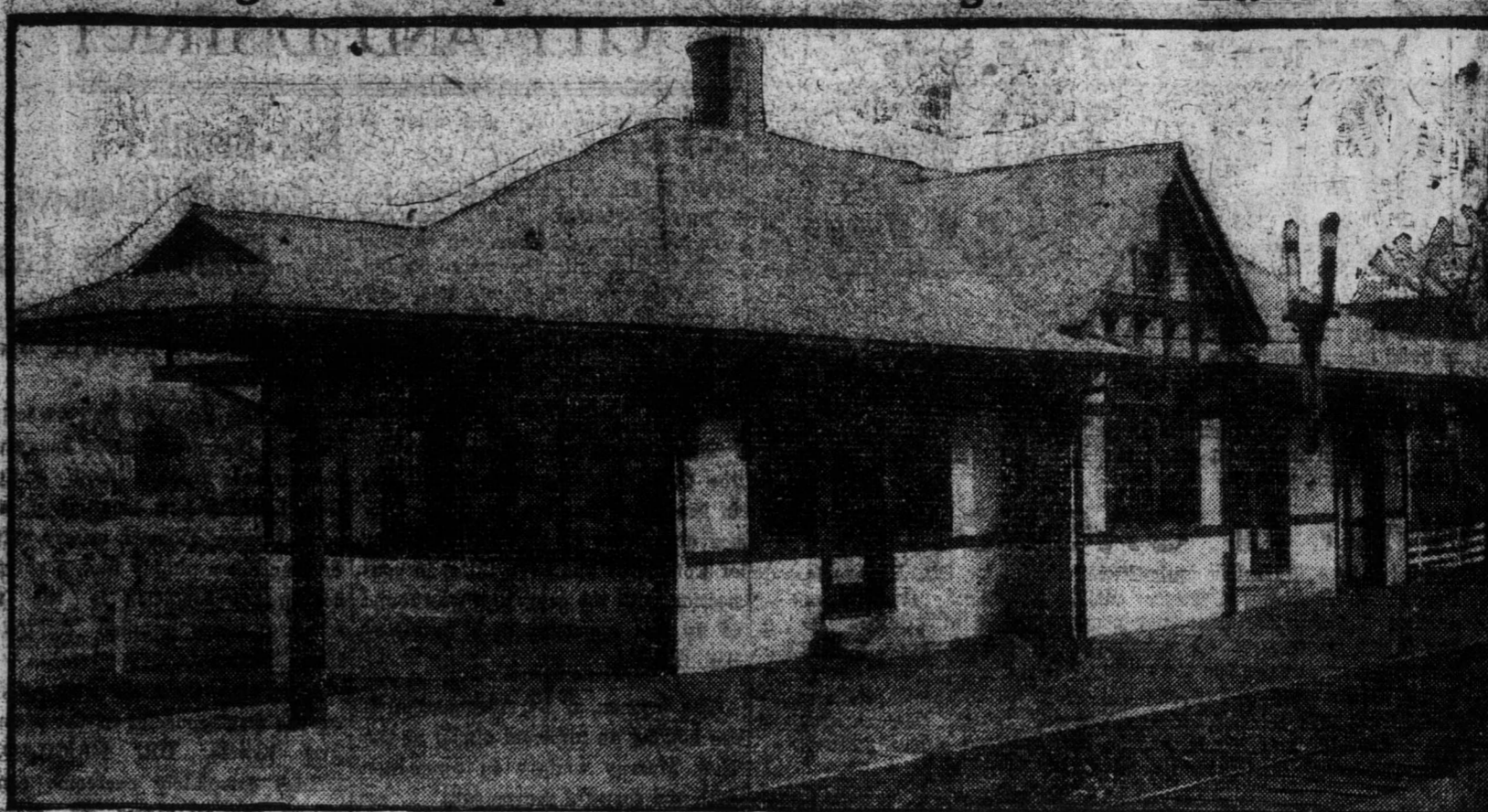
The new Dominion Atlantic Railway Passenger Station at Bridgetown.

Not only is the Canadian Pacific Railway making advances in accordance with the necessities of the times, and providing every modern improvement for the convenience and comfort of the public, but all its subsidiary lines are similarly progressive. The Dominion Atlantic Railway, which serves a large portion of Nova Scotia and runs through the beautiful land of Evangeline, now owns and operates The Pines Hotel at Digby, providing first class accommodation for the large number of tourists who visit the district. A new night service between Halifax and Yarmouth has recently been inaugurated. This night service leaves Yarmouth on Monday, Wednesday and Saturday evenings, and Halifax on Sunday, Tuesday and Friday, and marks one of the most important developments since the through line of railway from Yarmouth to Halifax was opened up for traffic in 1917. These trains carrying on a combined freight and passenger service, but only carloads of through merchandise are carried.