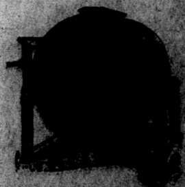
AUTOMATIC CENTRAL DELIVERY TEA AND FLOUR BLENDER.

Patent Automatic TEA MILLING, COFFEE, CHOCOLATE, CACAO, PEPPER, MUSTARD, SPICES, AND ALL OTHERS. Gas-Heated Roaster—Extracts, Flavors, and Perfumes. Gas-Heated Roaster—Cocoa, Peppermint, and other Flavors. Sifters, Weighing Scales, and other Machinery. Grinding Mills, Flour, and other Products. Air Driers, and other Machinery. Patent Fruit Blenders. Quick Shred and other Machinery.