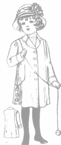
6759 Child's Single Breasted Coat, 4 to 8 years.