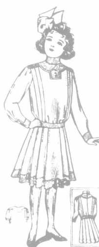
6748 Girl's Dress, 8 to 12 years.

Please order by number, giving age or measurement, as required, and allowing at least ten days in which to receive pattern. Price of patterns, ten cents each. Address: Fashion Dept., "The Farmer's Advocate," London, Ont.