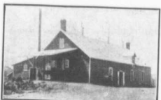
A Prosperous Farmers' Cheese Factory

I was surprised to learn from Farm and Dairy that there are so many cheese factories in Eastern Ontario still paying by the pooling system. It would seem that patrons have not given this matter the attention that, in their own interests, it deserves.