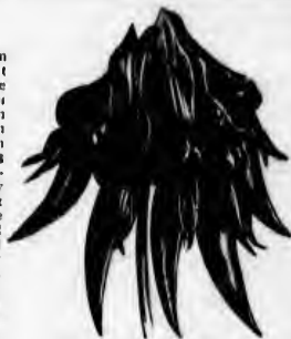
CLIANTHUS DAMIERI. Showing Flower.