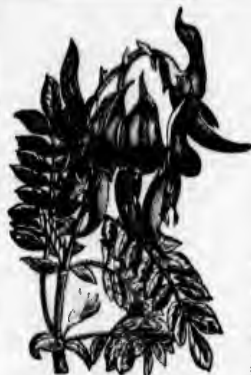
CLIANTHUS DAMIERI. Showing Stem and Flower.