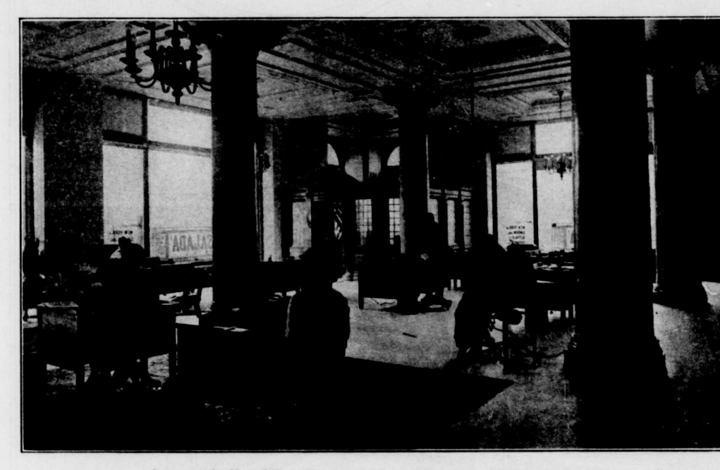
Corner of the Main Office, Showing the General Manager's Office in the Rear