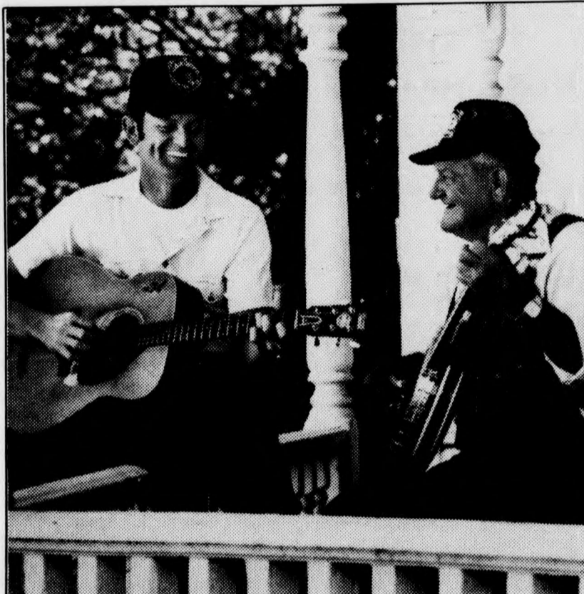
Jack Daniel's Tennessee Whiskey is presented in Canada by FBM Distillery Ltd., Brampton, Ontario

SUPERB CHINESE FOOD DINING, TAKE-OUT & HOME DELIVERY UNIVERSITY CITY PLAZA 59 FOUR WINDS DR., DOWNSVIEW, ONT. PHONE: 736-4646 SUN-THURS, 11:30 a.m.-12:00 midnight FRI & SAT, 11:30 a.m.-1:00 a.m.