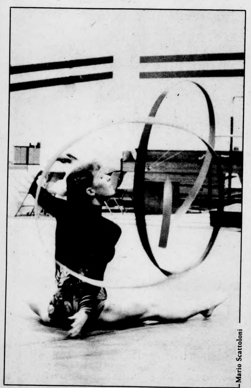
Flash and Flare at the CIAU championships