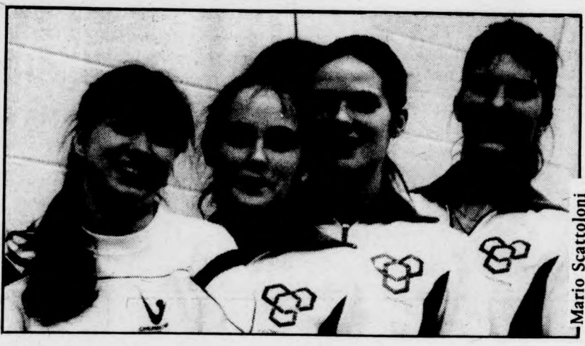
All smiles...Yeowomen wrapped up a fifth place finish