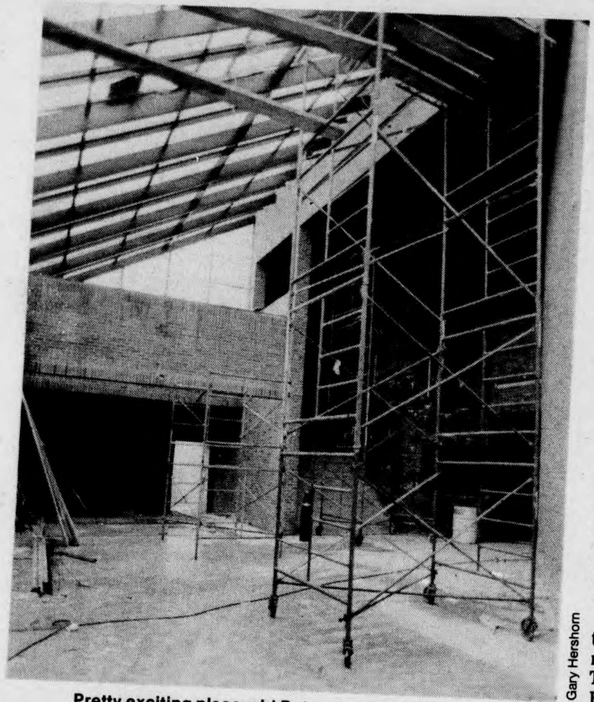
Pretty exciting place, eh! But.... come September.