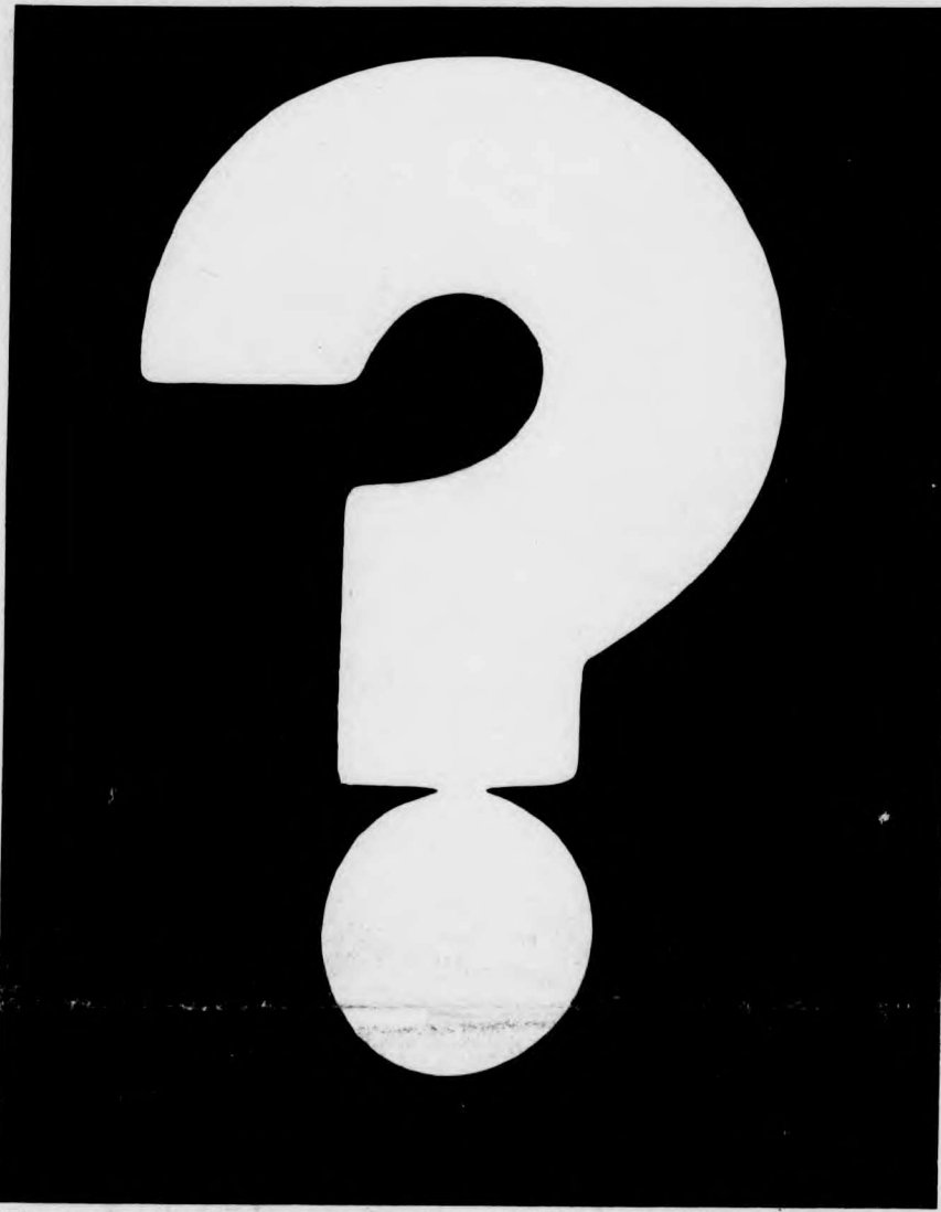
The real crunch comes next—how will the search be run in finding someone to fill York's top-dog spot?