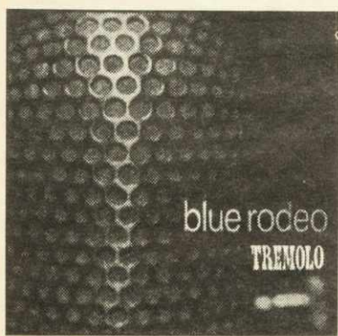
Tremolo Blue Rodeo WEA/Warner

With Tremolo , Blue Rodeo has begun to discover that improving on perfection is indeed a trying task.