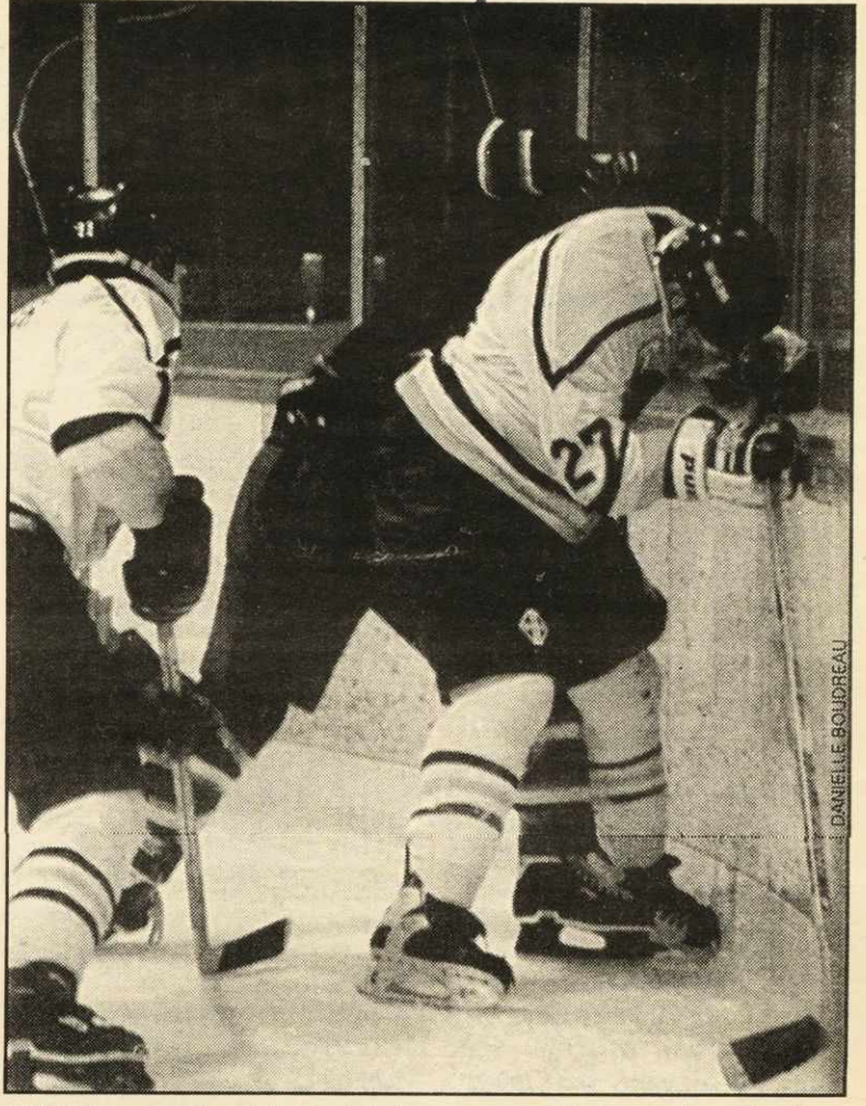
2,000 fans packed Memorial Arena to see Dal demolish the St. FX X-Men 8-3 in game one of their best of three playoff series. Games two and three are Antigonish this weekend.

Do you know sports? Do you like going to games? If so, the Gazette wants you. Come by our office on the third floor of the SUB. Writers meetings are 4:30 p.m. every Monday. It's a great way to get involved in campus life and have some fun.