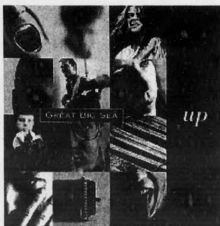
Great Big Sea • Up

Sam The Record Man, Fredericton Shopping Centre