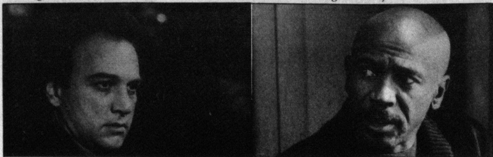
Jim Belushi partners up to Lou Gossett

The rest of the cast give mixed performances in supporting roles. Gossett seems bored, typecast in the same role he played before, during, and now after winning an Oscar. Rae Dawn Chong is okay as the dedicated