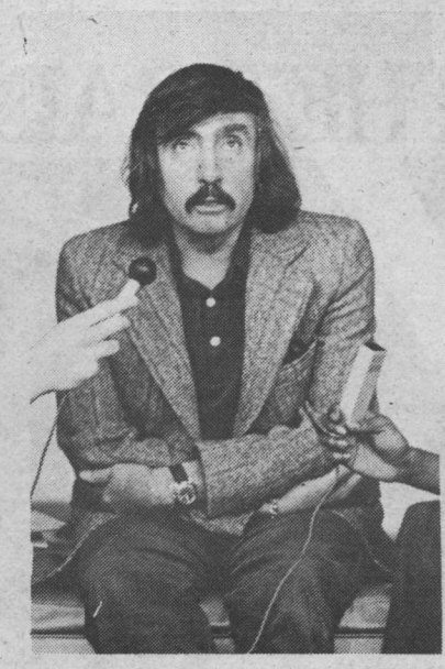
Edward Albee is under attack