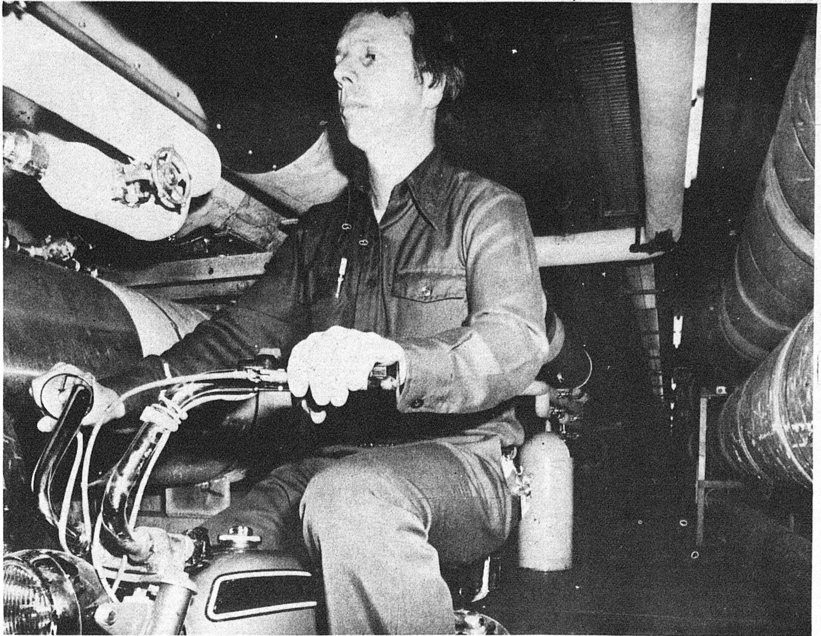
Eyes intent on the narrow path, a service technician drives through the U of A tunnel system. No wheelies

The old haunt has been technological masterpiece. The light, clean, well cared-for appearance of a sophisticated machine which never shuts down. The service-men to maintain the general and to repair any problems which may arise. There is even engineers and other people who work from the fourth floor level who ensure the smooth operation of the system. At the U of A is dependent upon services Corridor, whether we are in the little Hugeness, and the life underneath.