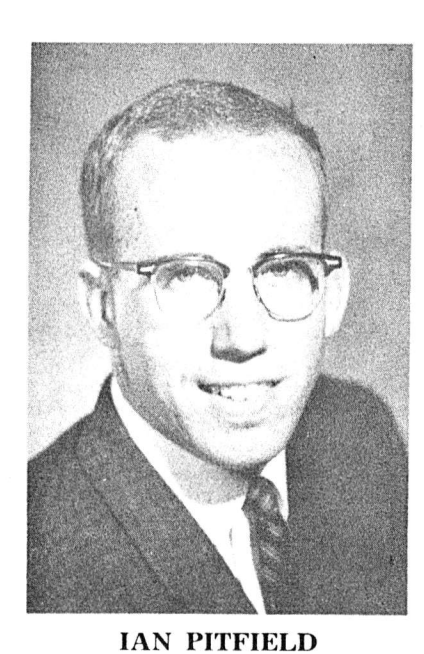
. . . Liberal