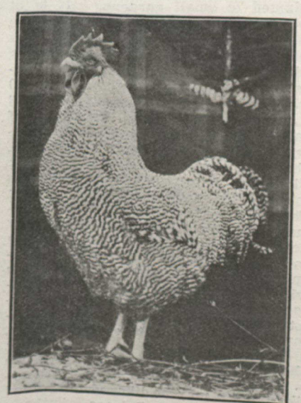
Good Type of Barred Rock.

"IN addition to that it is only necessary for me to point out to you that we are on the eve of great developments, and that our population is increasing and will continue to increase rapidly; that we have the great and growing West to cater to in the supply of poultry and eggs. We have a big market there to supply. We have towns springing up which must be supplied with poultry. We have embryo poultry men in every village and hamlet and farm in the great West, and they must be supplied with hatching eggs, and parent stock, and with that as a fact, surely to goodness, we should be producing, and must produce within five years, ten times the poultry that is being produced in Canada to-day. In other