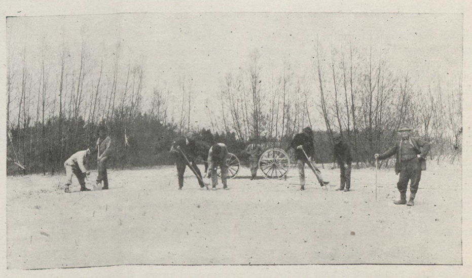
Blocking the sand dunes of Prince Edward County, Ontario, by planting trees. The planting gang is putting in willows and poplars. The willows in the background have attained their remarkable height in ten years.

In the memory of residents in the neighborhood, all the sand at one time was quite near the shore of Lake Ontario. It consisted of high hills and deep swampy tree growth, and the latter with thick cedar swamps and areas suitable for pasture. But as time went on, the oft repeated foolishness of clean cutting wooded areas on poor soil was indulged in, the trees were removed, with the result that the fine particles of sand of which the hills were composed, commenced to drift and despoil forest land and good agricultural soil as it was driven by the prevailing north-west winds.