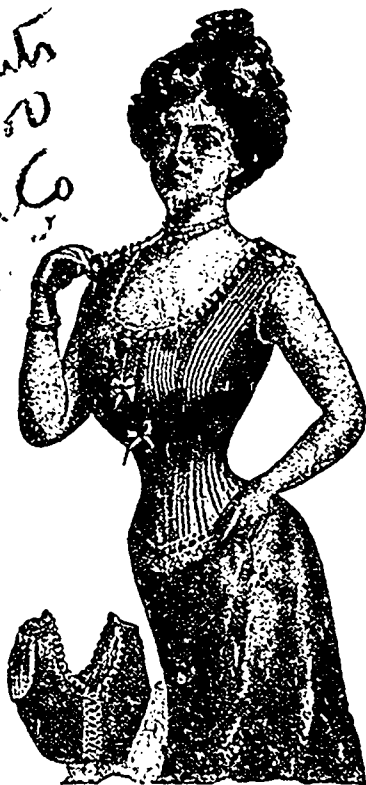
Patented Jan. 10, 1900.