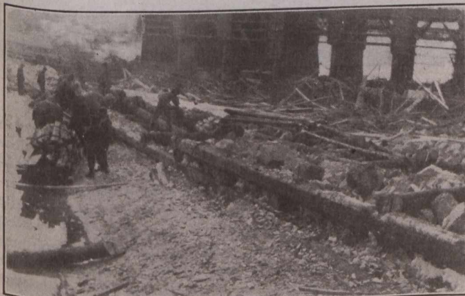
Fig. 7.—The First Cofferdam Being Removed

granite with intrusions of black basalt, two of which have been decomposed by the action of frost and water resulting in an east and west channel with a smooth island of granite in the centre, which gave the place its name. The west channel for a distance of 50 feet or more is only about 5 feet wide and possibly 40 feet in depth, and as the